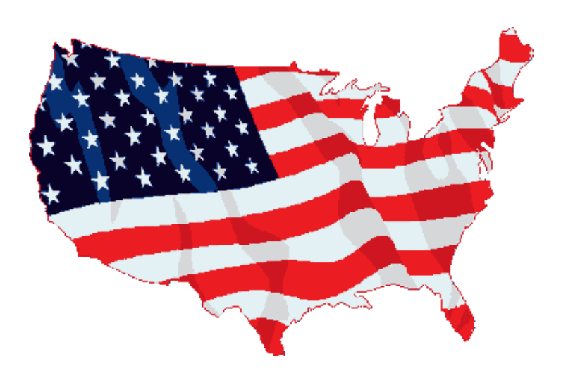
Proudly designed and built in the USA